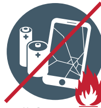
No Batteries or Electronics

be thrown in the trash. When in doubt, throw it out!