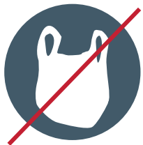
No Plastic Bags (drop off only)

Every year the recycling program grows here in St. Francis and it's because of you! You are using the recycling carts in the parks. You are recycling at home and in your local businesses. You are also participating at the recycling events provided throughout the year. So, thank you and let's keep up the good work! Here are a few reminders to help you recycle more and recycle better.