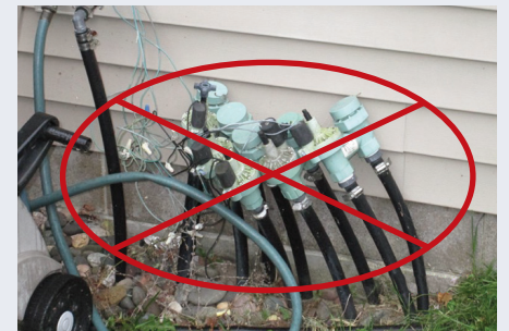
This is not an approved backflow prevention device.

A backflow prevention device is used to protect potable water supplies (wells and drinking water) from contamination or pollution due to backflow, caused by a sudden drop in pressure in the distribution system. In water supply systems, water is normally maintained at a significant pressure to enable water to flow from the tap, shower or other fixture.