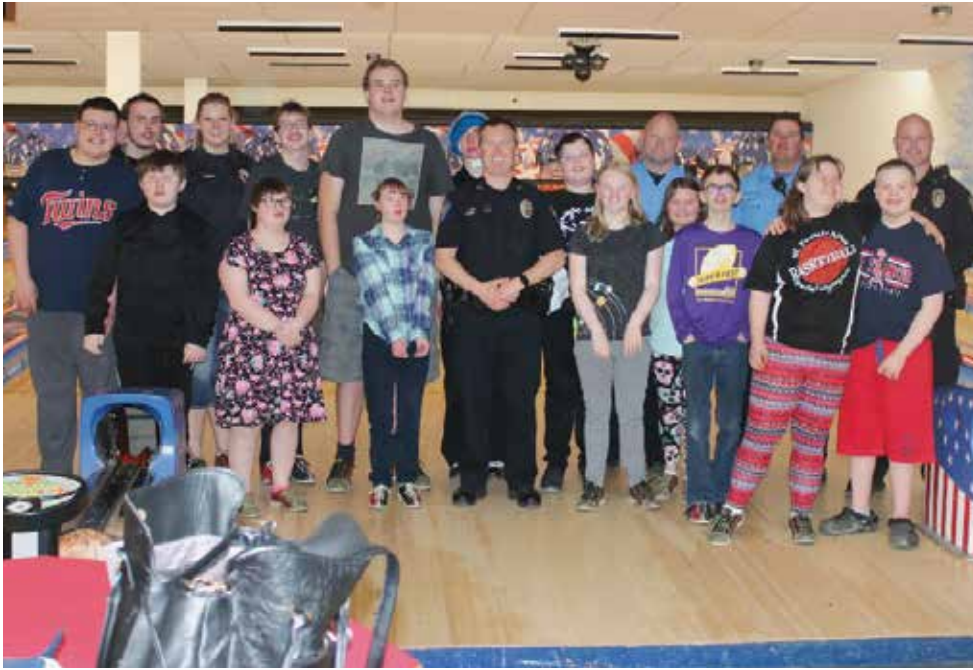
Winning with Cops aids developmentally disabled children and adults in overcoming life's obstacles through exercise, team sports and positive interaction. Follow the St. Francis Police Department on Facebook to see what and when our next event will be this fall!