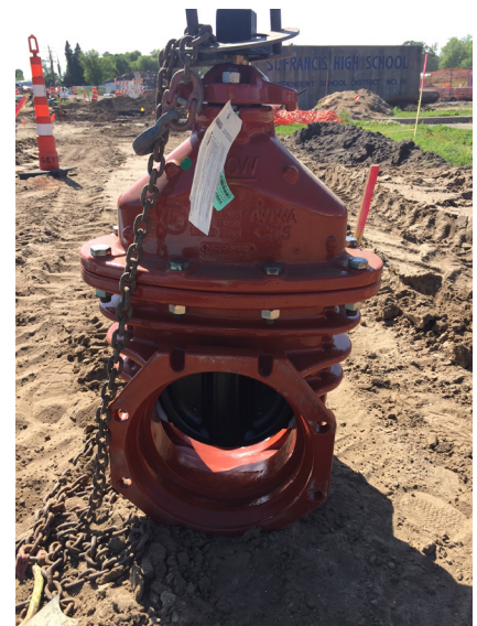
New Isolation Valves

Isolation valves (gate valves) are just like the valves that turn the water on and off in your home or business. They serve the same function with our water distribution system, they allow the Public Works Department to isolate smaller sections of the water main to perform maintenance. Also, in the event of a water main break, we are now able to isolate the break more