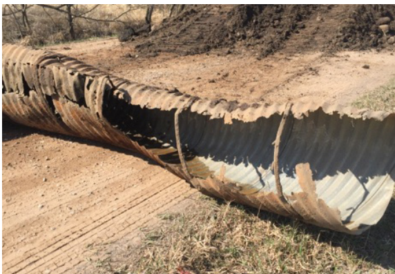
Replacement of city-owned culverts due to deterioration (Nacre/233rd) in early spring.

Stormwater fees include the maintenance of ditches, city-owned culverts, piping, curb and gutter, ponds and catch basins.